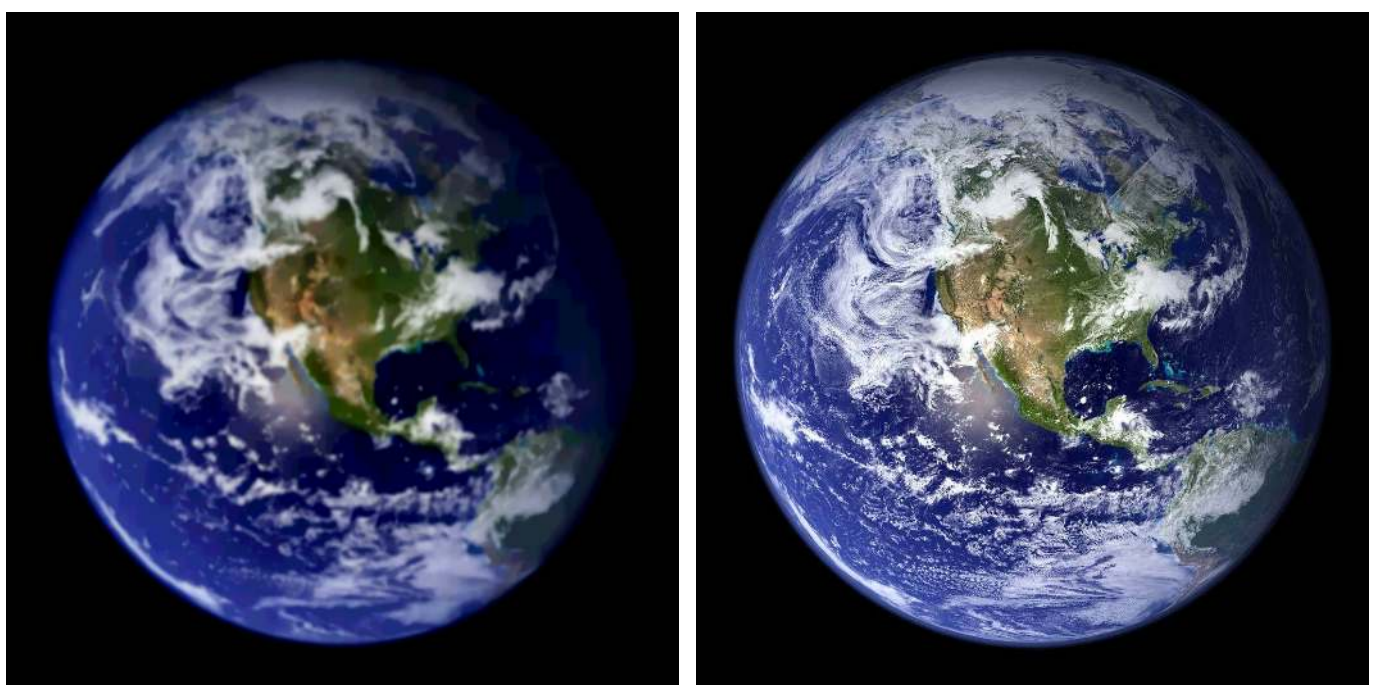
(a) Blurry test image

The task is to unblur the image. A clear reference image is also provided.