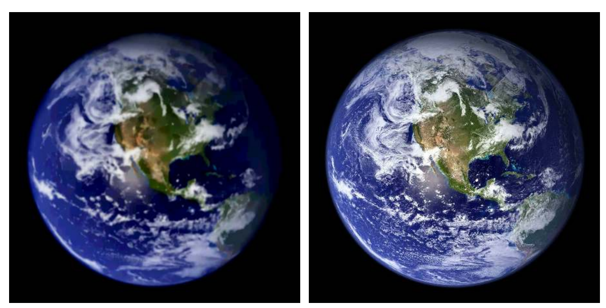
(a) Blurry test image